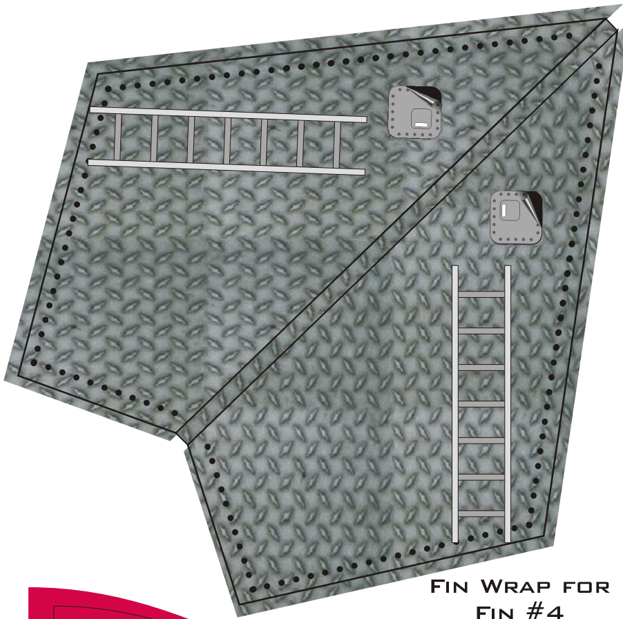
FIN WRAP FOR FIN #4